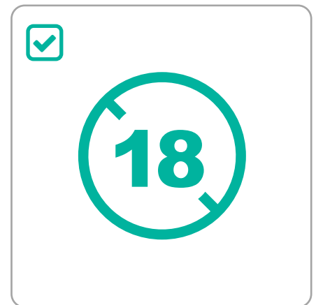
Over the age of 18